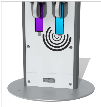
Example of Totem Base Plate attached to totem

Base Plate - Ground fixings NOT supplied