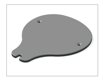
Smooth Polydek Seat

Designed to British & European Standard BS EN 1176