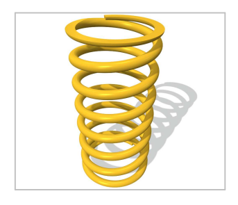
High Quality Steel Spring