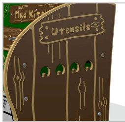
Integrated Utensil hooks