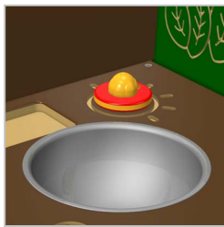
2 X Removable Stainless Steel mixing bowls included