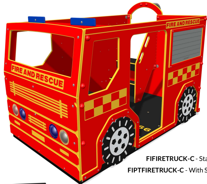
FIFIRETRUCK-C - Standard FIPTFIRETRUCK-C - With Sounds

Fire Truck - Fully assembled excl. Fireman's Pole