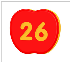
Apple Shaped Lap Counters