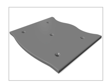
Smooth Polydek Seat

Designed to British & European Standard BS EN 1176