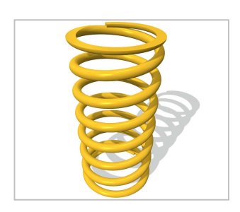
High Quality Steel Spring